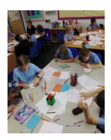
Year 5 & 6